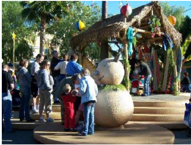
Here you can take a photo with a laid-back, tropical Santa, or play games, such as constructing a "sand-snowman" in a Mr. Potato-Head-esque manner, by day...