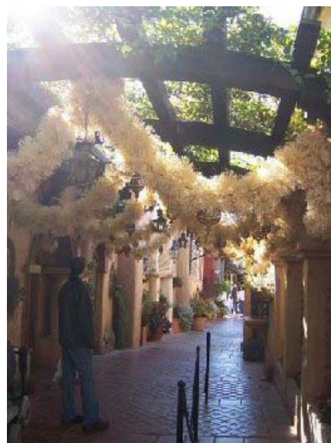
...and the more restrained but festive area near Rancho del Zocalo has been draped with garlands, too.