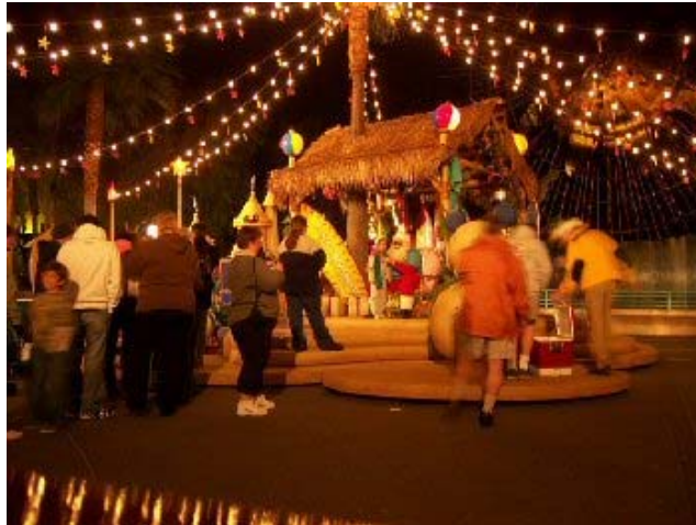
...or by night!