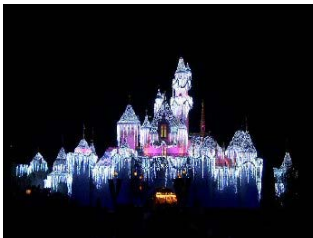
But there's nothing more spectacular than Disneyland's Sleeping Beauty Castle at night! The new icicle-and-snow treatment is astoundingly beautiful in the dark, especially when the tiny lights covering the turrets shimmer and make the snow illusion even more convincing. The cool blue tinge to the castle's lights is a striking contrast to the warm yellow glow of Main Street in front of it and King Arthur Carrousel behind it.