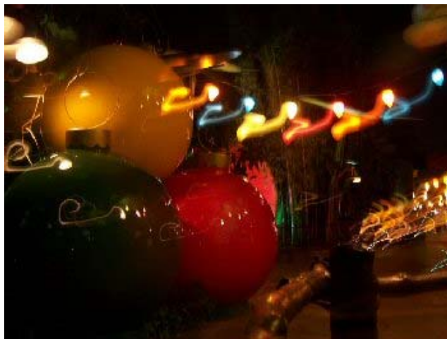
Giant ornaments have dropped into A Bug's Land.