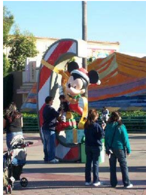
The holiday sightseeing continues over in California Adventure, where the "California" letters have been covered with candy cane stripes, and Mickey and Goofy (and a bunch of kids) climb on the letters.