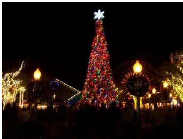
California Adventure gets its own tree in Golden State Park, complete with carolers.