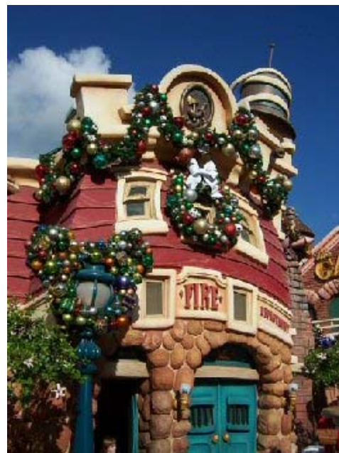
Even the wacky 'toons have decorated their land...