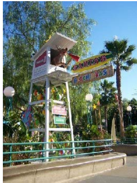
Sunshine Plaza (known as Candy Corn Acres only two months ago) has been transformed into Santa's Beach Blast.