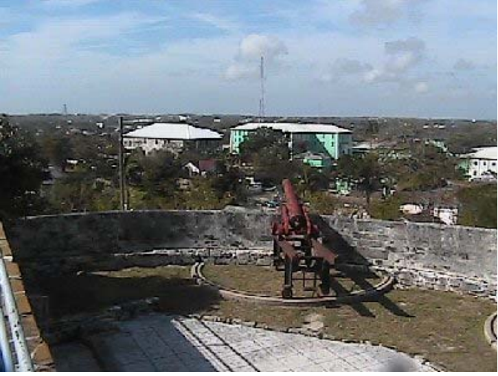
The view from Fort Fincastle.

We peeked outside and were greeted by a clear day in the Bahamas, and sunny yellow, pink, and turquoise-painted buildings. When we scrambled down the gangway, we were also greeted with humidity and what seemed like an entire town full of shops. We ducked our heads and got through the maze of shops in the entrance building, and then started our walking tour.