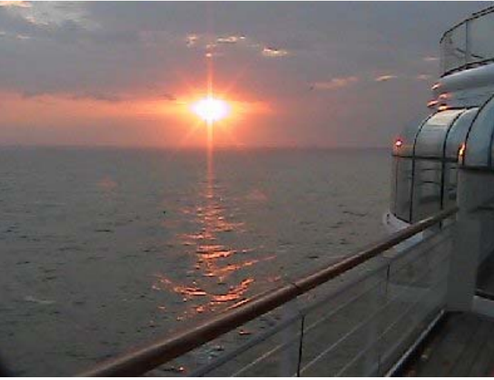
Watching the sun set in the ocean while eating free ice cream - the perfect vacation!

After the safety drill, we found some lounge chairs outside and, with the horns sounding the first notes of "When You Wish Upon a Star," we were off! It was very secluded in our little area, and we felt like we were on a private cruise, watching a gorgeous sunset. Then we went to enjoy free ice cream!