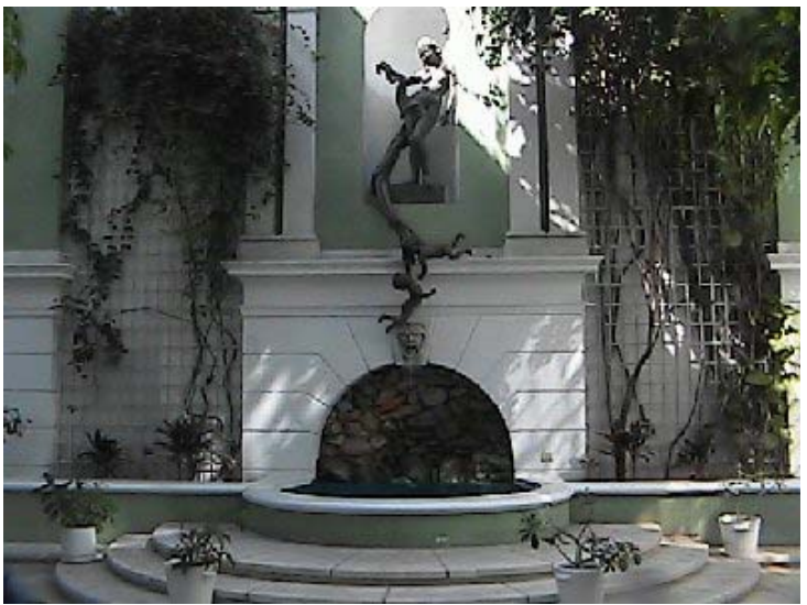
We ducked into this courtyard to cool off.

By the time our mini tour was over (visiting places such as Fort Fincastle, the Queen's Staircase, and many colorful buildings), I was ready to browse the jewelry shops. We picked up some good deals, using our coupon book obtained on the boat the night before, and were ready to head back. Having been on dry land all day, I was optimistically looking forward to eating dinner at Animator's Palette that evening. But, we also made sure to pick up some complimentary motion-sickness medicine from the medical center before heading to some onboard festivities.