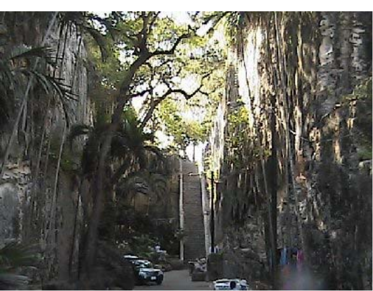
The Queen's Staircase is an impressive sight.