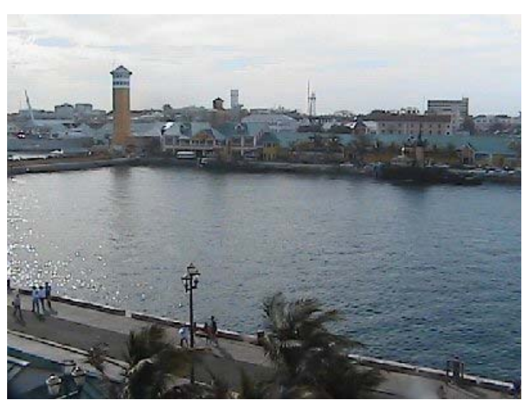
Our first glimpse of the Bahamas.

We peeked outside and were greeted by a clear day in the Bahamas, and sunny yellow, pink, and turquoise-painted buildings. When we scrambled down the gangway, we were also greeted with humidity and what seemed like an entire town full of shops. We ducked our heads and got through the maze of shops in the entrance building, and then started our walking tour.