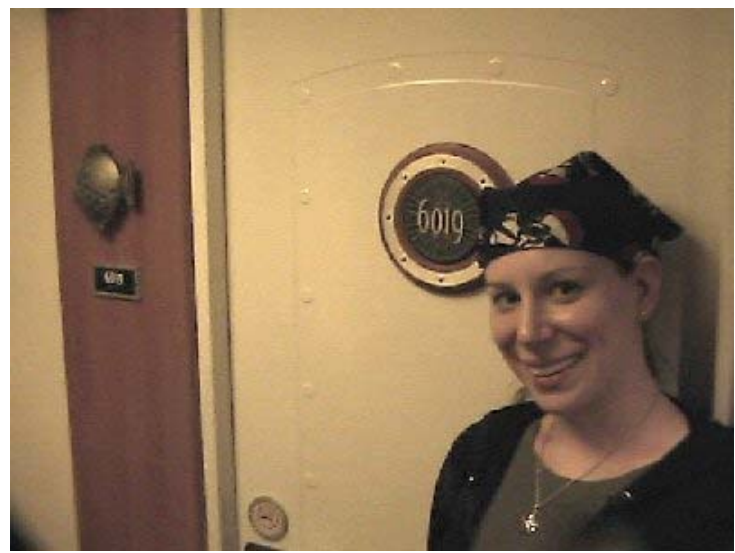
I might be a little seasick, but it's "Pirates in the Caribbean" night, and I'm having fun.

It was "Pirates in the Carribean" party night that evening, and we all got pirate bandanas at dinner. I was a little wobbly heading out, but tying my bandana around my head must have made me feel tougher, because I thoroughly enjoyed the fireworks and people-watching at the pirate party. Watching fireworks explode from our boat in the middle of the ocean, with total darkness all around us, was one of the highlights of our cruise.