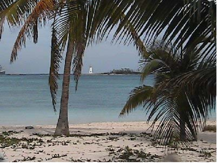
A beach for two.

We decided to spend the night before our cruise in Cape Canaveral, so we